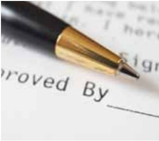
Waiting for major medical