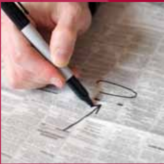
TRANSITIONING BETWEEN JOBS