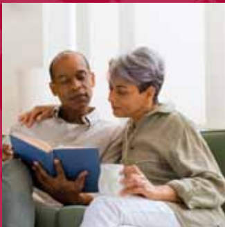
WAITING FOR MEDICARE COVERAGE