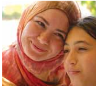
Recently naturalized U.S. citizens

There are transitional periods in life that can leave you without medical coverage for a brief time. HCC Medical Insurance Services understands your need for peace of mind about health insurance coverage during uncertain times. STM Complete SM provides affordable temporary health insurance to protect you and your family. You should consider purchasing STM Complete if you are concerned about protecting yourself from the potentially high medical costs associated with an unexpected sickness or injury. STM Complete is ideal for: